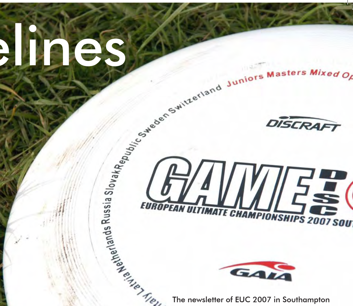
Game Disc at EUC2007

The newsletter of EUC 2007 in Southampton