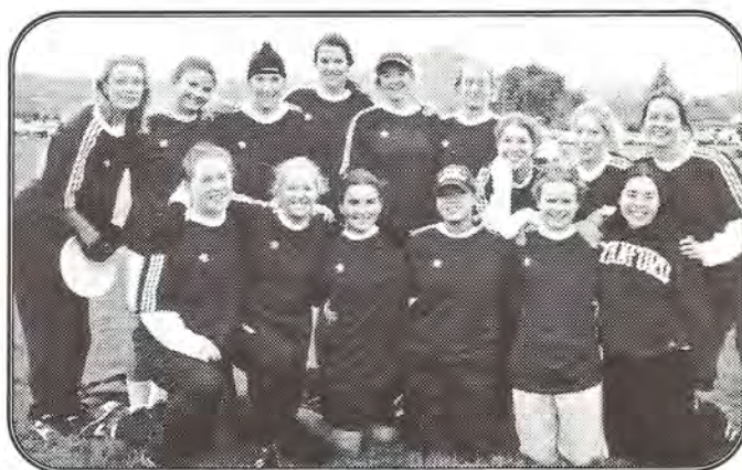
STANFORD WOMEN "B":