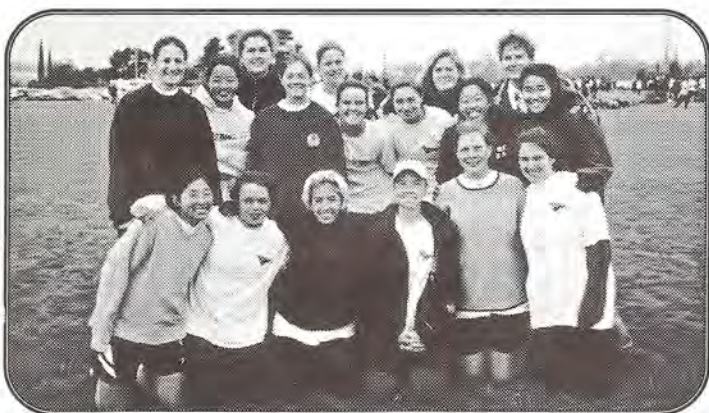
STANFORD WOMEN "A"