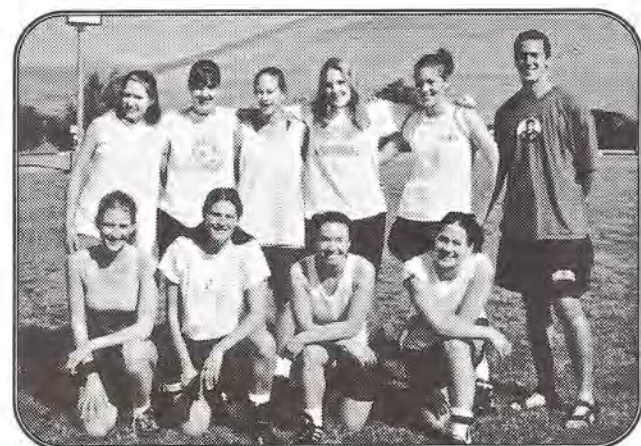
SONOMA STATE WOMEN