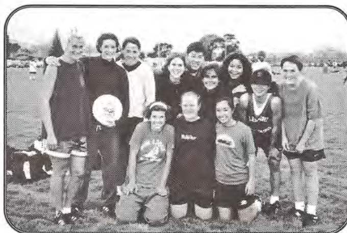
UC BERKELEY WOMEN