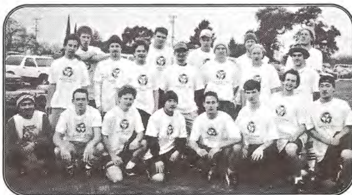
UC BERKELEY MEN