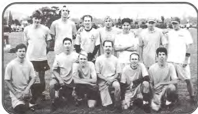
UC DAVIS MEN