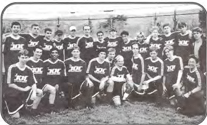
STANFORD MEN "B"