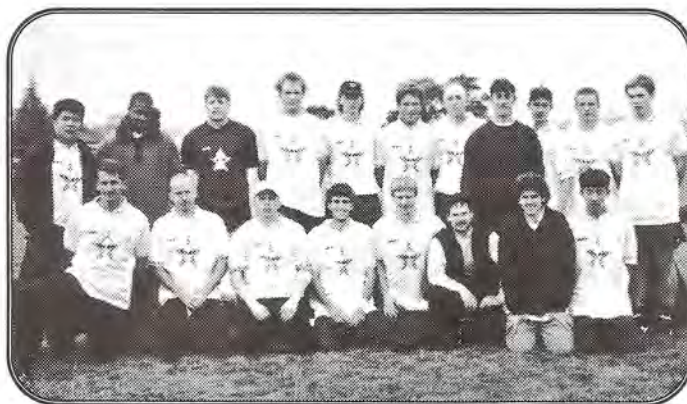
STANFORD MEN "A"