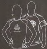
CUSTOM TEAM GEAR