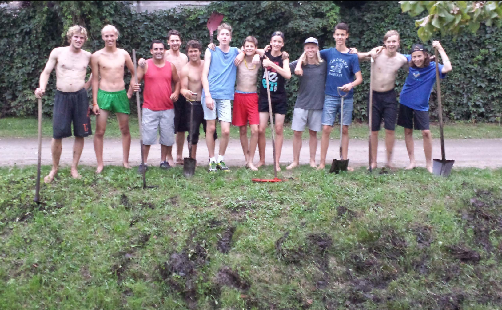
Players and coaches help to drain the fields on Thursday evening.