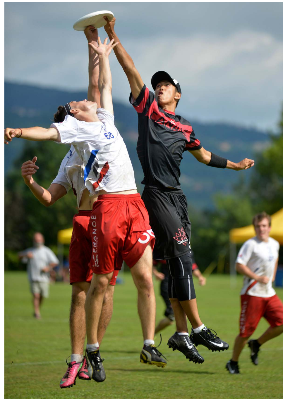
Simultaneous catch in Canada vs. France.