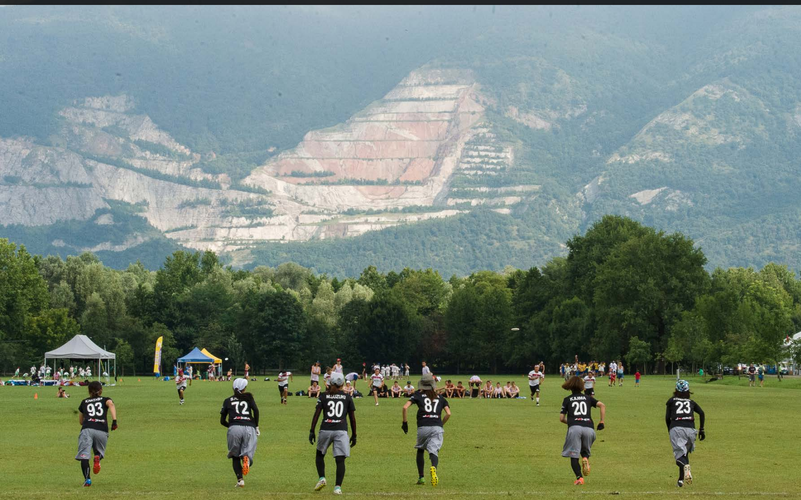
Japan women