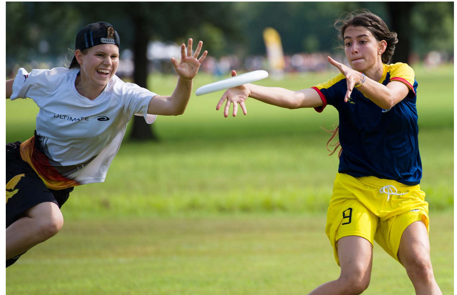
Germany vs. Colombia