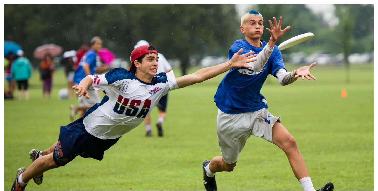
Israel vs. United States

Pool D was less exciting, as only one game, Poland's 17-12 win over the Czech Republic, decided by fewer than 10 goals. Top seeds Germany and France cruised, while last seeded Poland was the day's big surprise, recording big wins over the Czech Republic and Belgium. Belgium, the Czech Republic, and Chinese Taipei aren't mathematically eliminated yet, but it looks like Germany, France, and Poland will be the three teams advancing.