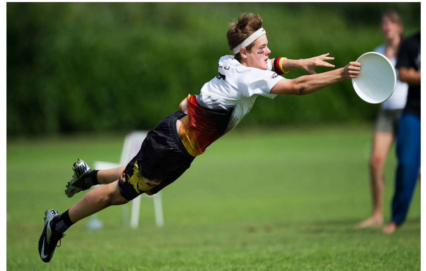
Germany player bids