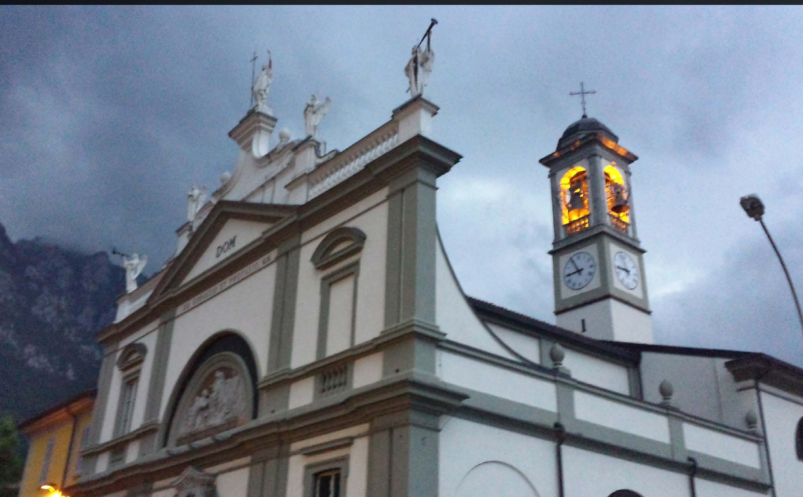
Lecco Church