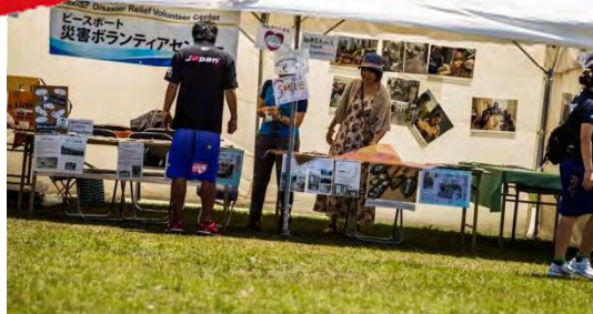
Please visit Charity market tent for victims of last year's Earthquake and Tsunami hit on Tohoku area.