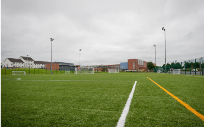
TUS Moylish Campus