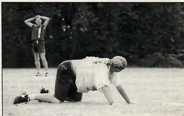
Do you get contact-lens timeouts?

Winners prizes will be delivered — thanks to all who participated.