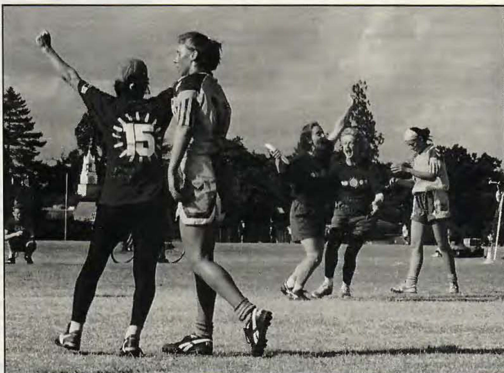
G.B. Women celebrate as they score the winning point

Tonight's film Rocky Horror Picture Show (...if you're not going to the WFDF Forum, that is.) in the Lecture Theatre Block (LTB) at 8.00 pm