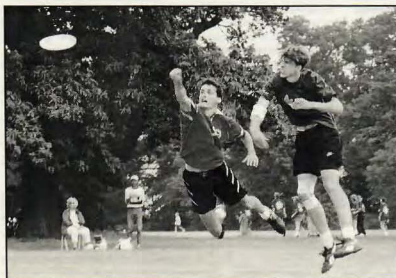
Long-range layout in open division pool B: Canada 18 - 14 Germany

of games played Monday 22nd August, and positions at start of play today