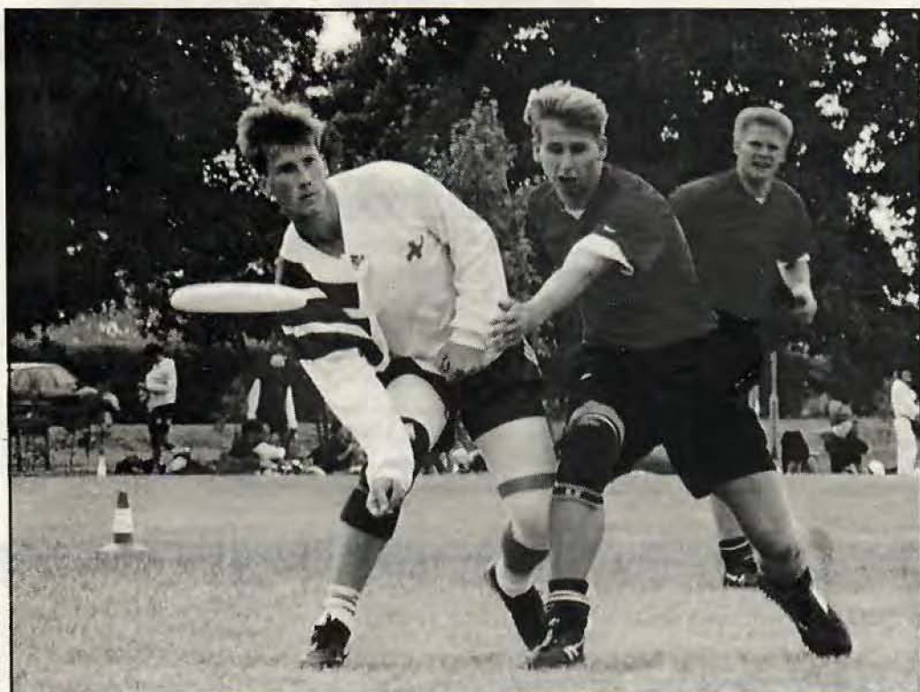
Scandinavian shoot-out in Open Pool A: Finland 21 - 9 Denmark