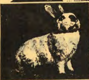
A Local Rabbit