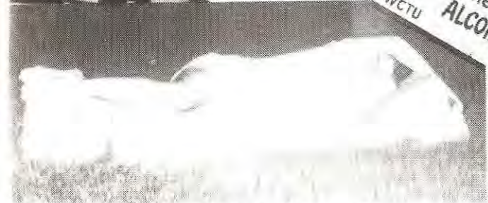
Pillar dreams about being slim