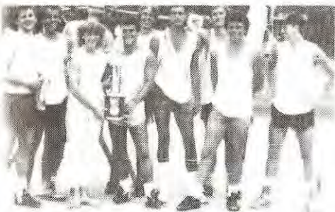
Milkmen 1986 Poultry Days