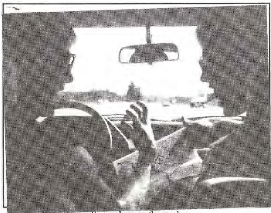
Somewhere on the road

Welcome to the eighth annual Central Ultimate Championships. The Park Hippiies from St. Louis are back to defend their open division title, and Nemesis is back to defend the women's title. Over twenty mens and womens teams from all over the Midwest and Mid-Atlantic regions are here to vie for the trophies.