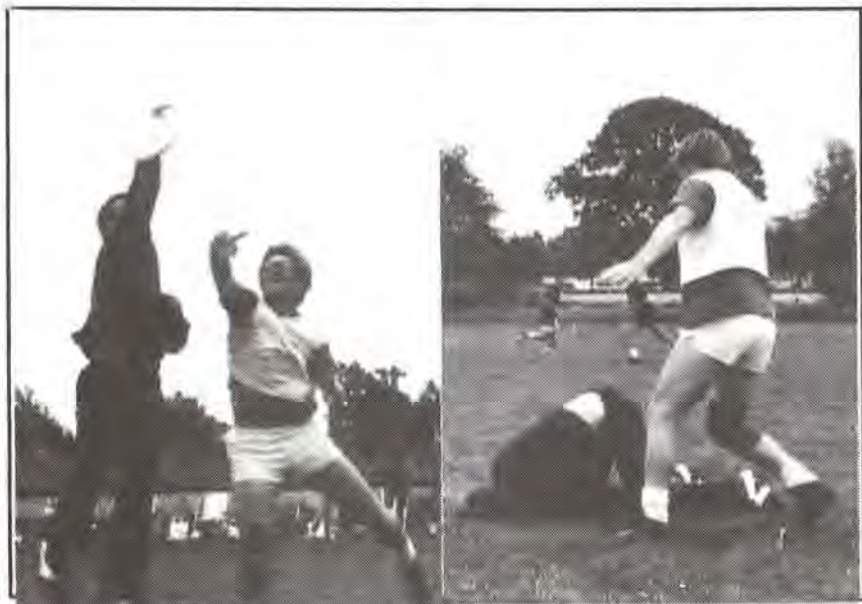
Cypher skies over Deli, then crumbles in a heap

1984 - Five straight days of rain provided ideal playing conditions for the '84 Centrals. Two Kansas teams joined the Centrals this time, as well as a Washington DC representative for the third time. Windy City beat