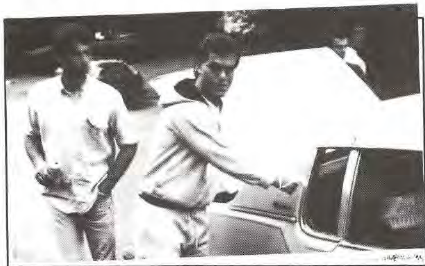
Fatty had a run-in with this opera window at the '87 Centrals

The tower depicted on this year's tournament design is the water tower at the Kalamazoo State Hospital, Michigan's first state hospital for the insane. It is a landmark for miles around, except you can't see it from the fields we're playing on. Look for it as you drive around town.