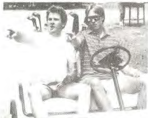
1986 Cypher Open