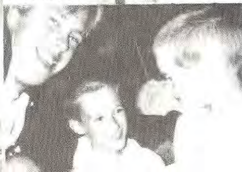
Coffee & Donuts Community Outreach Program