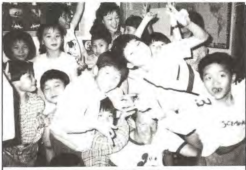
The little kids over there love the big red-head