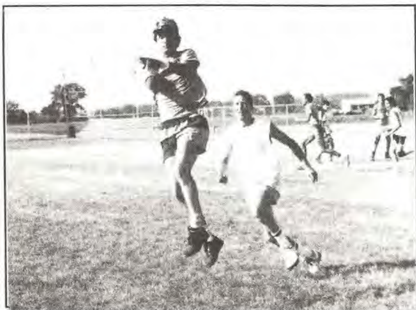
Poultry In Motion, 1988 Poultry Days

Trivia question: Since 1982, what was the only other team, besides the Park Hippies, to beat Windy City at the Central Ultimate Championships?