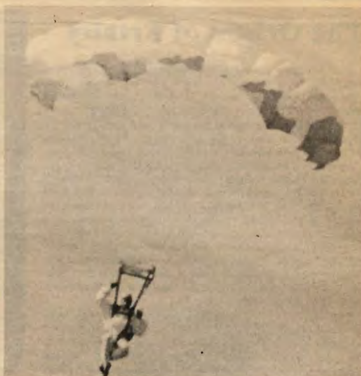
O.P. skydivers are back.