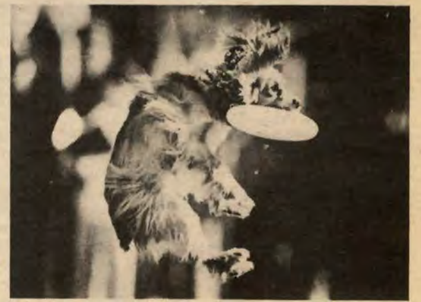
Noodle of Santa Cruz will join Buddy, Santa Cruz; Benson, Santa Barbara; and Tony, Sacramento, in K-9 freestyle competition.