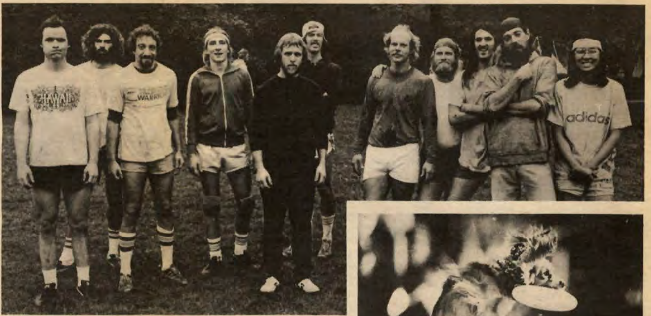
Santa Cruz's original ultimate team.