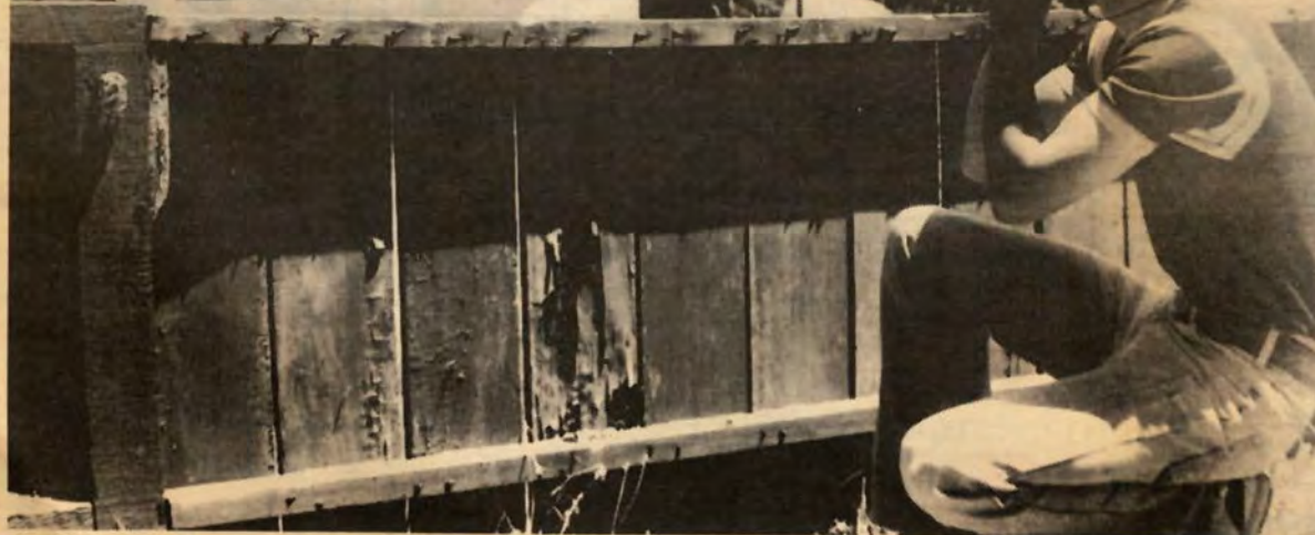
Ross Tobias Photography: 338-2988.