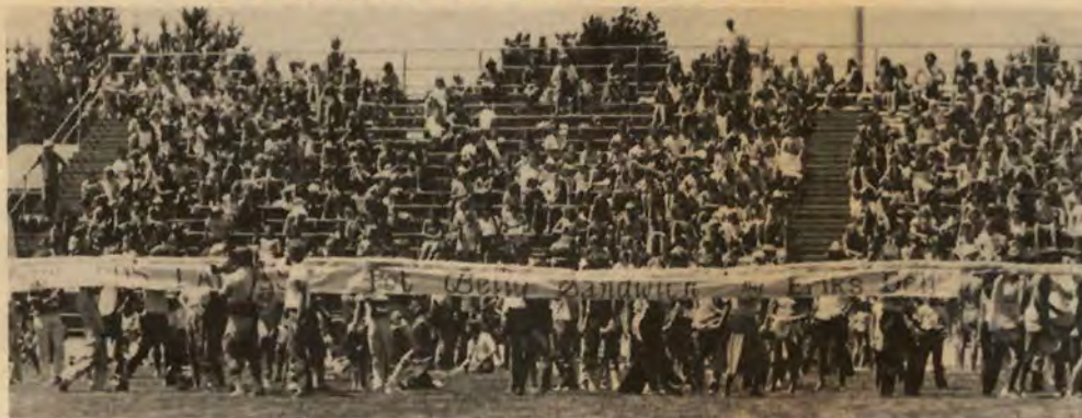
Erik's Deli back for the 5th year.